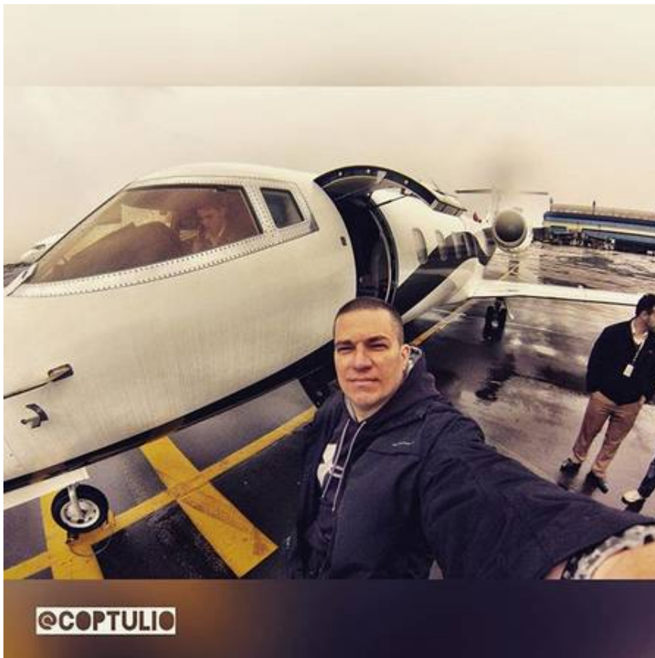
Tulio Costa in Queen tour South America

As a celebrity pays to have your service?