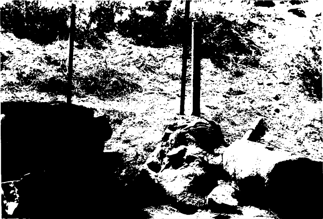
LOOKING WEST AT 1/4 COR